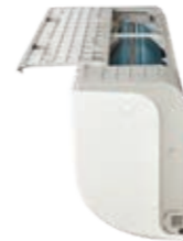
Removable dust filter